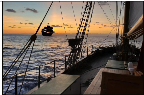
The Restauration approaches Bermuda at sunset, October 26.

Rose Stevens – 1-800-210-0240 Sons of Norway Financial Benefits Counselor