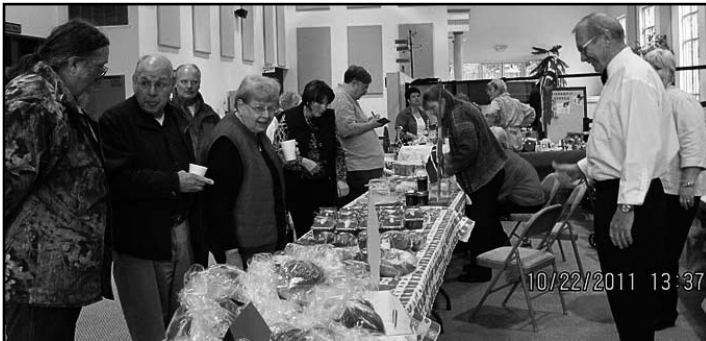
The Bake Sale was a popular place!